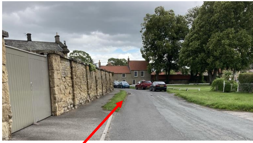
Encourage Residents to park on both sides of the road