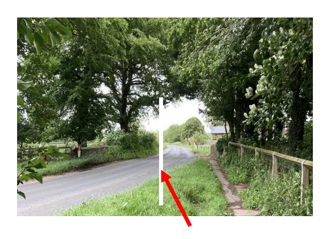
Position of TVAS