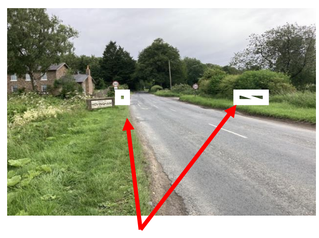
Position of Gateway Feature